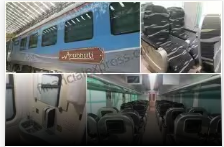
Anubhuti coaches with aircraft-like features to replace Shatabdi 1st-AC Executive chair cars; 20 amazing facts

Disclaimer: Views expressed are personal and do not reflect the official position or policy of Financial Express Online. Reproducing