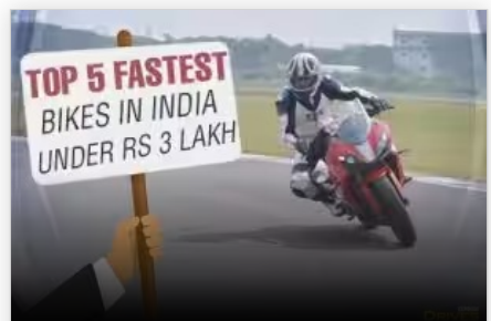
Top 5 fastest bikes in India under Rs 3 lakh: One of them is quicker than a sports car