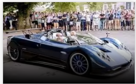
Top 6 World's most expensive cars cost over Rs 300 crores combined: Cars for the planet's richest