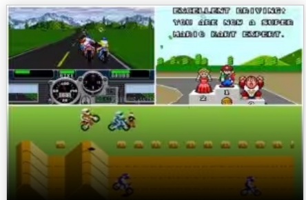
Top six racing games from the 1990s, how many do you remember